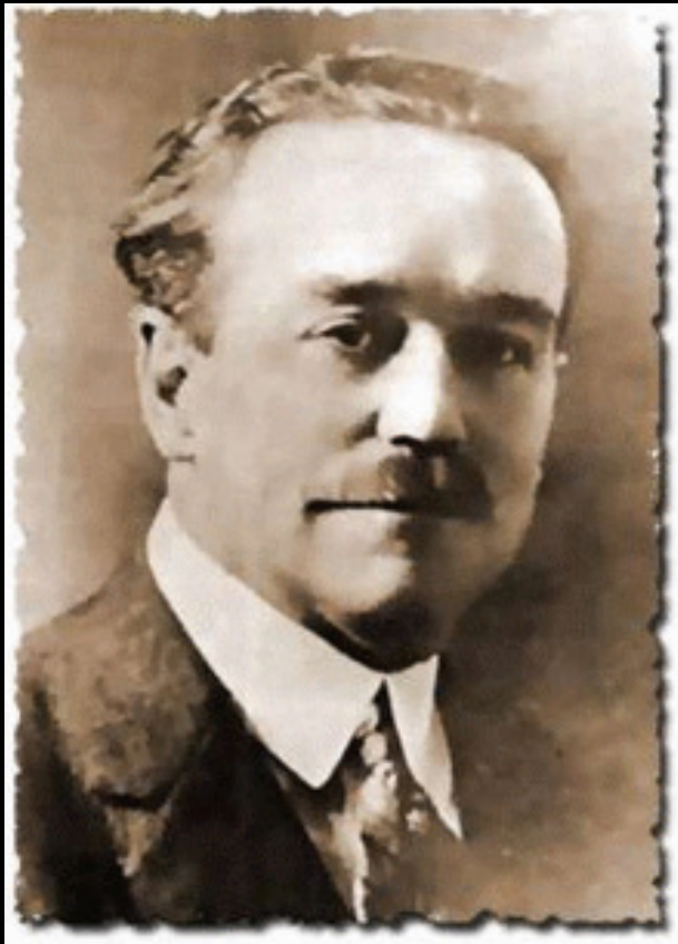
Charles Fox Parham (1873-1929)

Established Bethel Bible College in Topeka, Kansas in October 1900